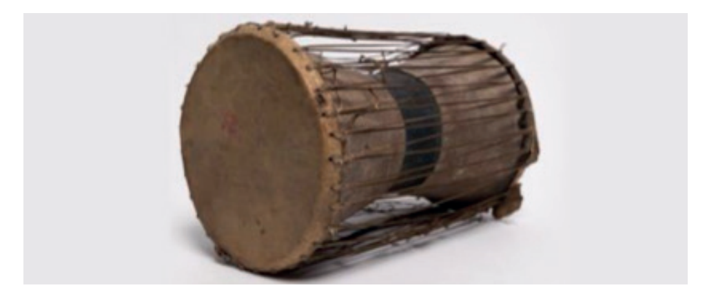
West-African Hourglass Drum