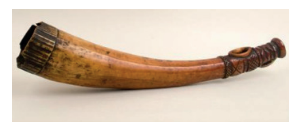
Side-blown trumpet made from varnished wood

These beautiful instruments from the RCM Museum make us think of animals! The rattle makes us think of a snake, slithering through the grass. The drum makes us think of a gorilla beating its chest. The trumpet makes us think of an elephant trumpeting its trunk!